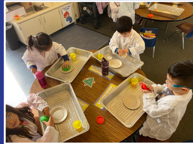
STEM Experiences with CAM