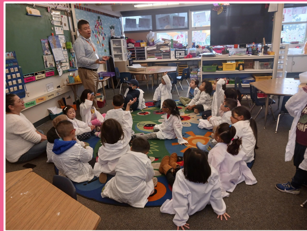
STEM Experiences with CAM