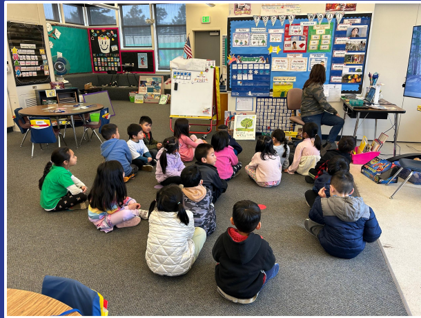
Learning Together on the Carpet