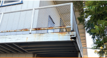
Deteriorating, rusting railings at Green Hills Elementary School.