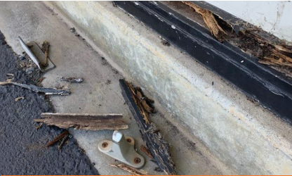
Dry rot at Taylor Middle School.