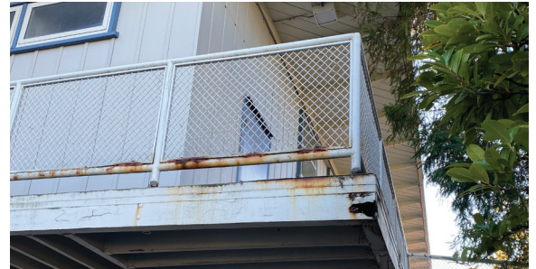
Deteriorating, rusting railings at Green Hills Elementary School.

In the past, the State funded 40 percent of school construction, but now leaves this entire responsibility to local communities. That's why voters in Burlingame and other San Mateo County communities have passed measures to support their schools. Currently, there are no resources available to improve or update Millbrae elementary schools. A similar measure in our community would allow Millbrae schools to complete identified improvements and ensure Millbrae students are prepared to compete in high school and college.