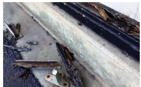
Dry rot at Taylor Middle School.